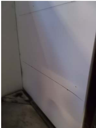
picture: edge of the large sample wing

Material construction und fixing see pictures below: